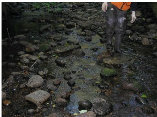
XS10; closeup of channel bed at XS10