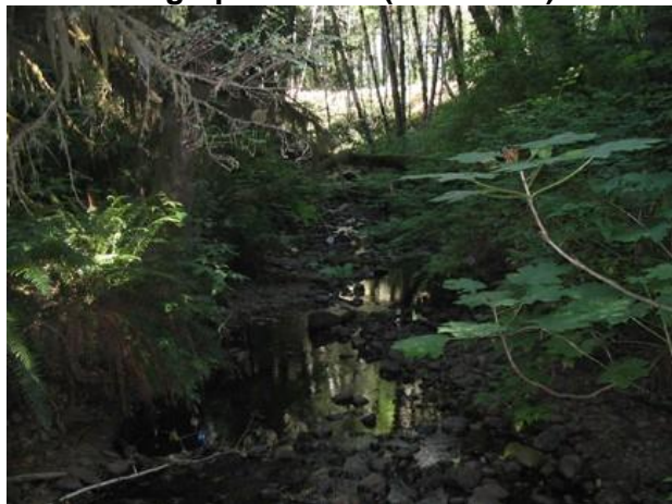
XS11; upstream view of channel, flagging delineates XS10