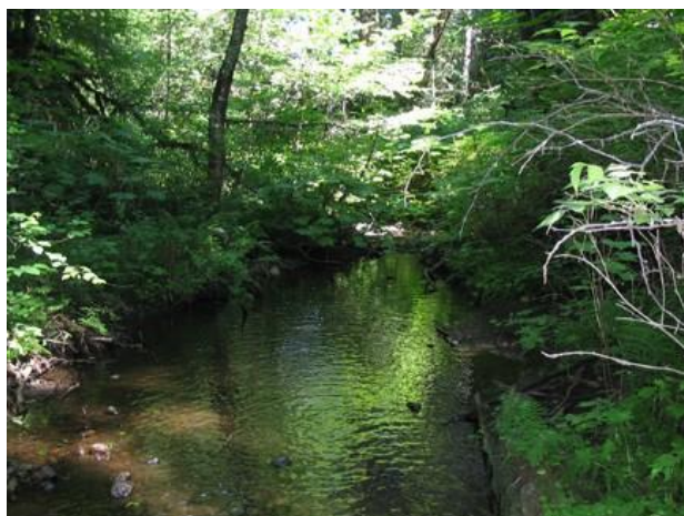
XS2-XS3; us view of pool btwn XS2-XS3