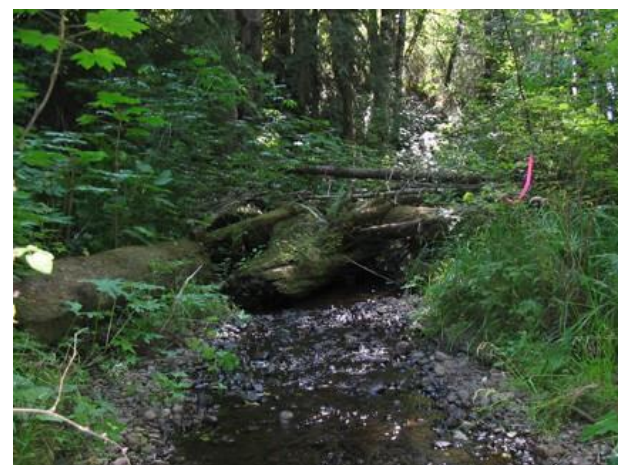
S3-XS4; ds view of channel, XS4, XS5, and debris jam