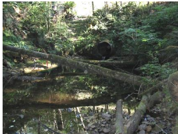
XS9-XS10; upstream view of channel, XS9, outlet, plunge pool