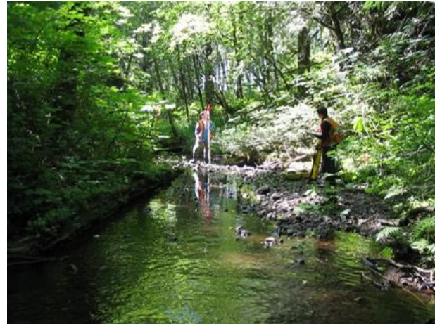
XS2-XS3; ds view of channel, XS3