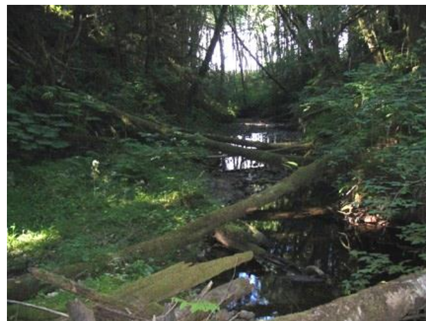
XS11; downstream view of channel and debris jam from XS11