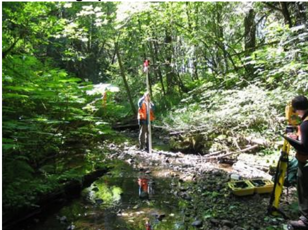
XS2-XS3; ds view of channel, XS3