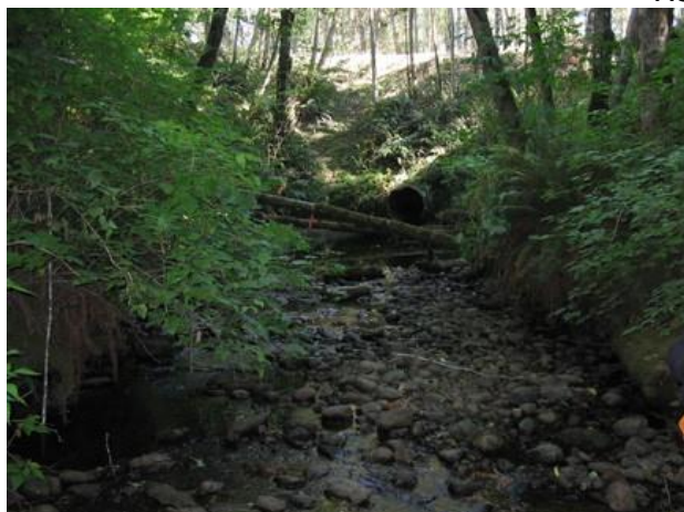
XS10; us view of channel, XS9, plunge pool, outlet